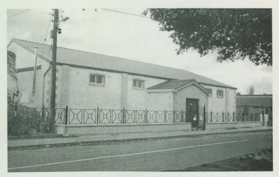
CARRICK SWAN INDOOR TRAINING AND RECREATIONAL CENTRE